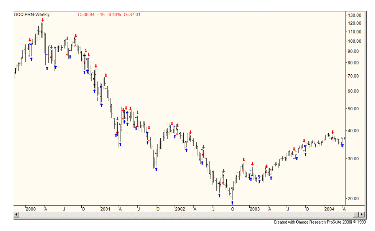
Figure 1 - 4% Swing System NASDAQ-100 Trust (QQQ) 1999-Apr 2004, Weekly Bars; Buys Indicated By Up Arrows Below Price Bars, Sells By Down Arrows Above Price Bars

rise above a prior weekly low and sells after a four percent decline from a prior weekly high. The system can be followed on a chart without a computer. The system was profitable during a 19-year back-test period from 1966 to 1985, prior to its publication, and has remained profitable since its publication.